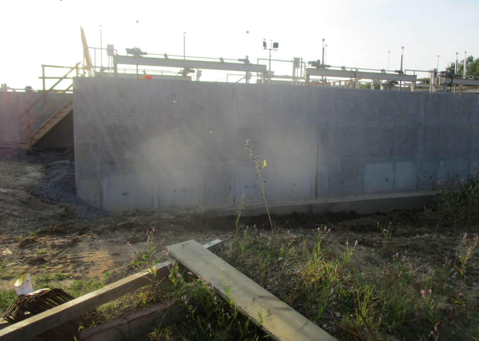
Vertical Loop Reactor - Photo 1