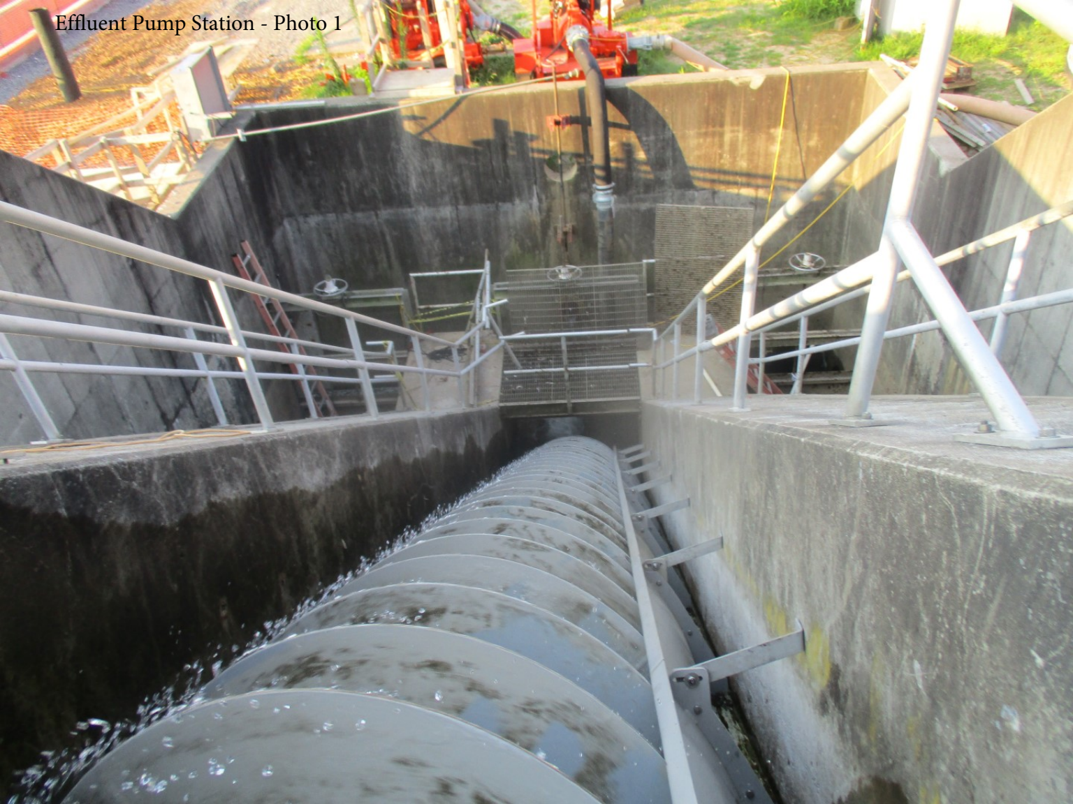
Effluent Pump Station - Photo 1