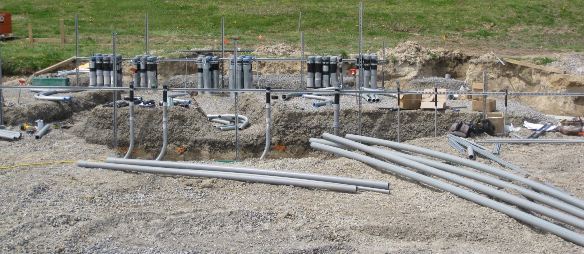
Electrical Building No. 1 Foundation - Photo 1