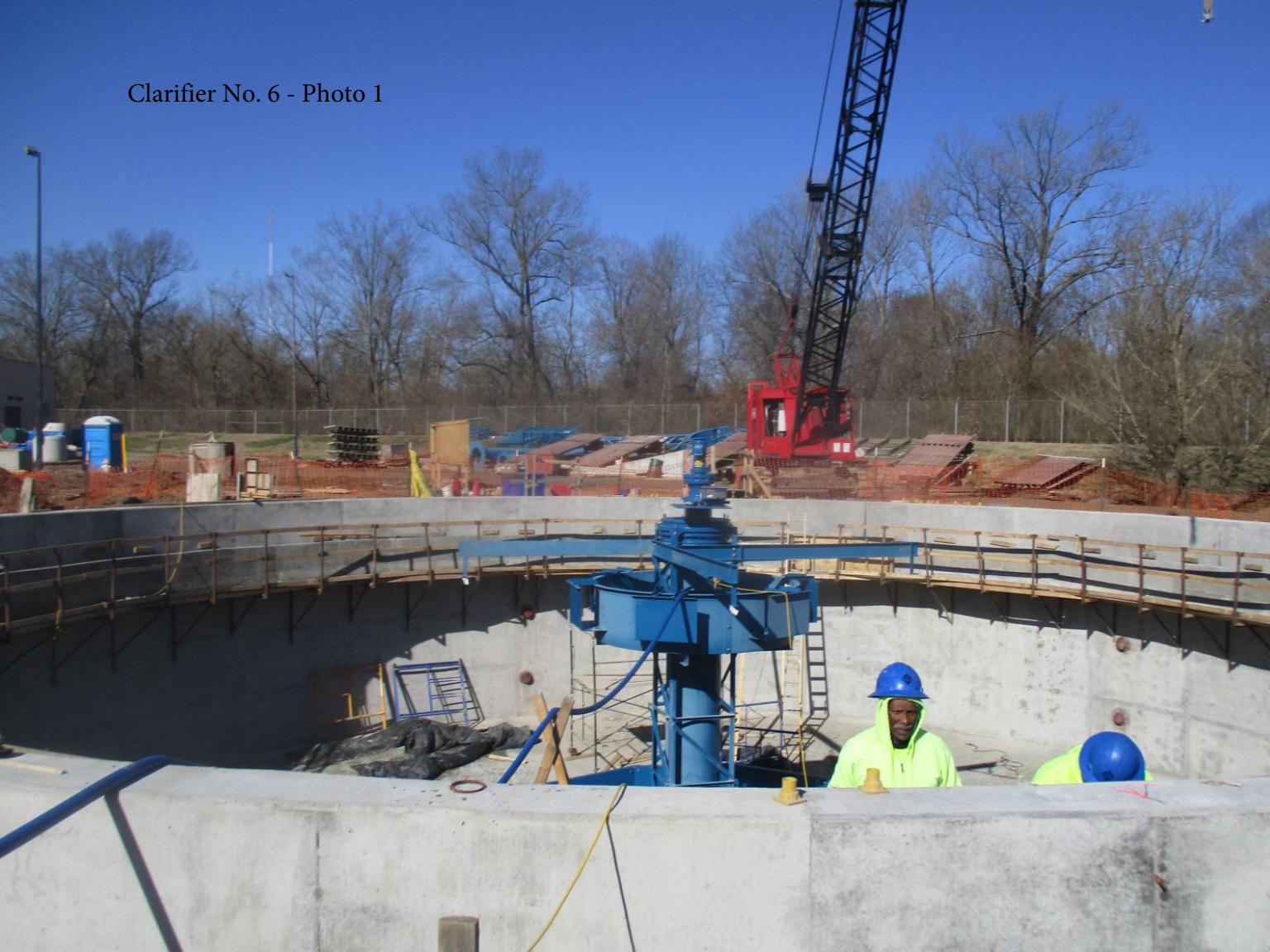
Clarifier No. 6 - Photo 1