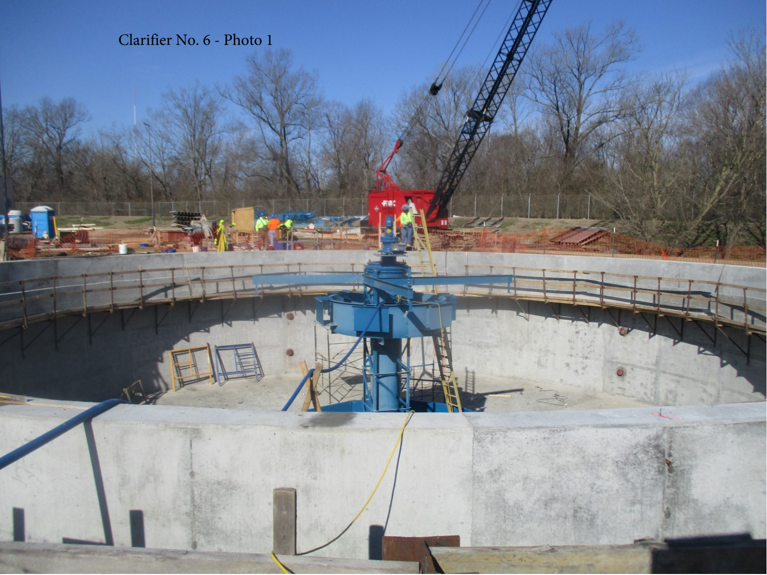
Clarifier No. 6 - Photo 1