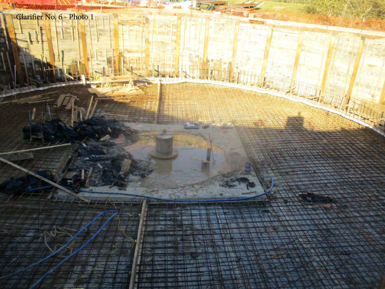
Clarifier No. 6 - Photo 1