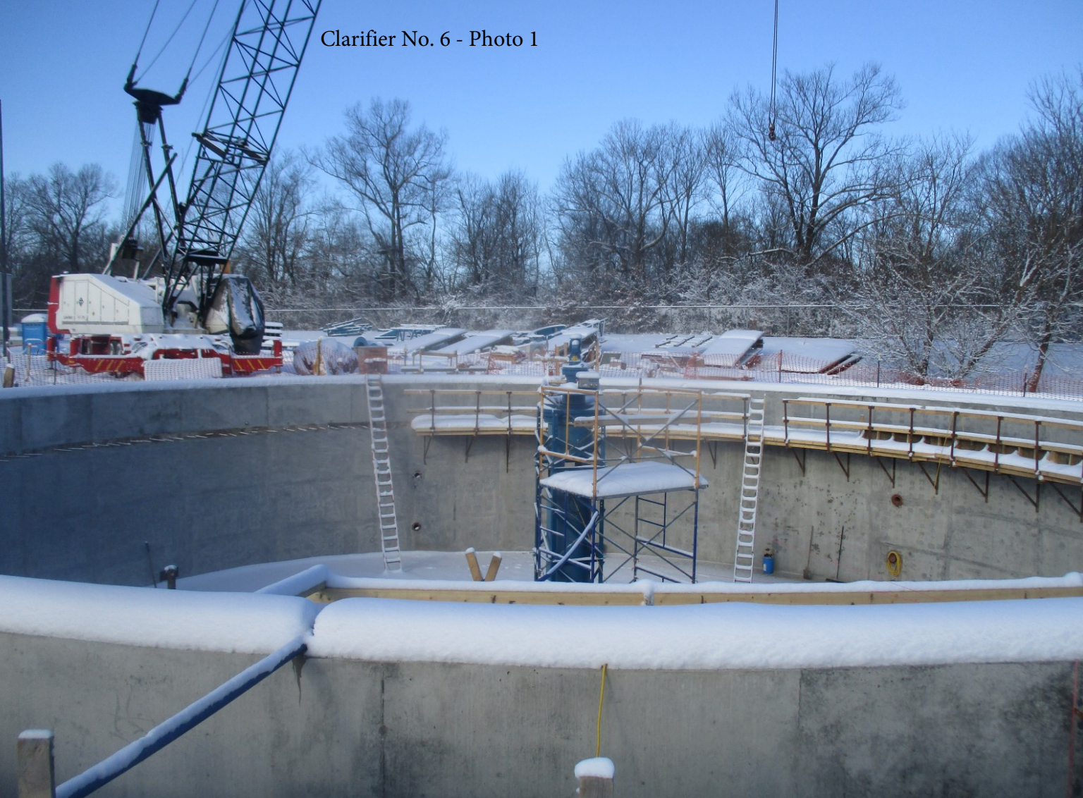
Clarifier No. 6 - Photo 1