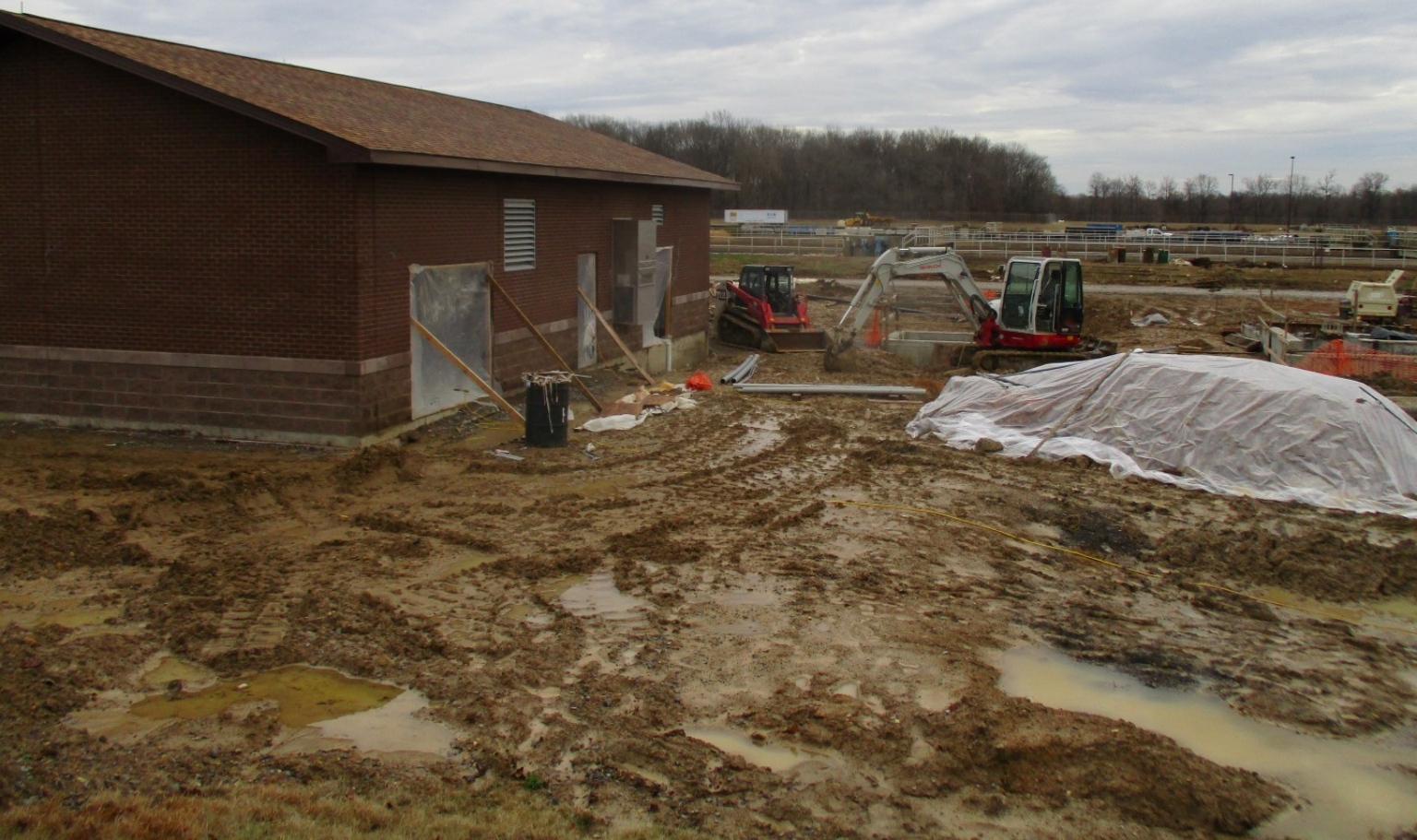
Electrical Building No. 1 - Photo 1