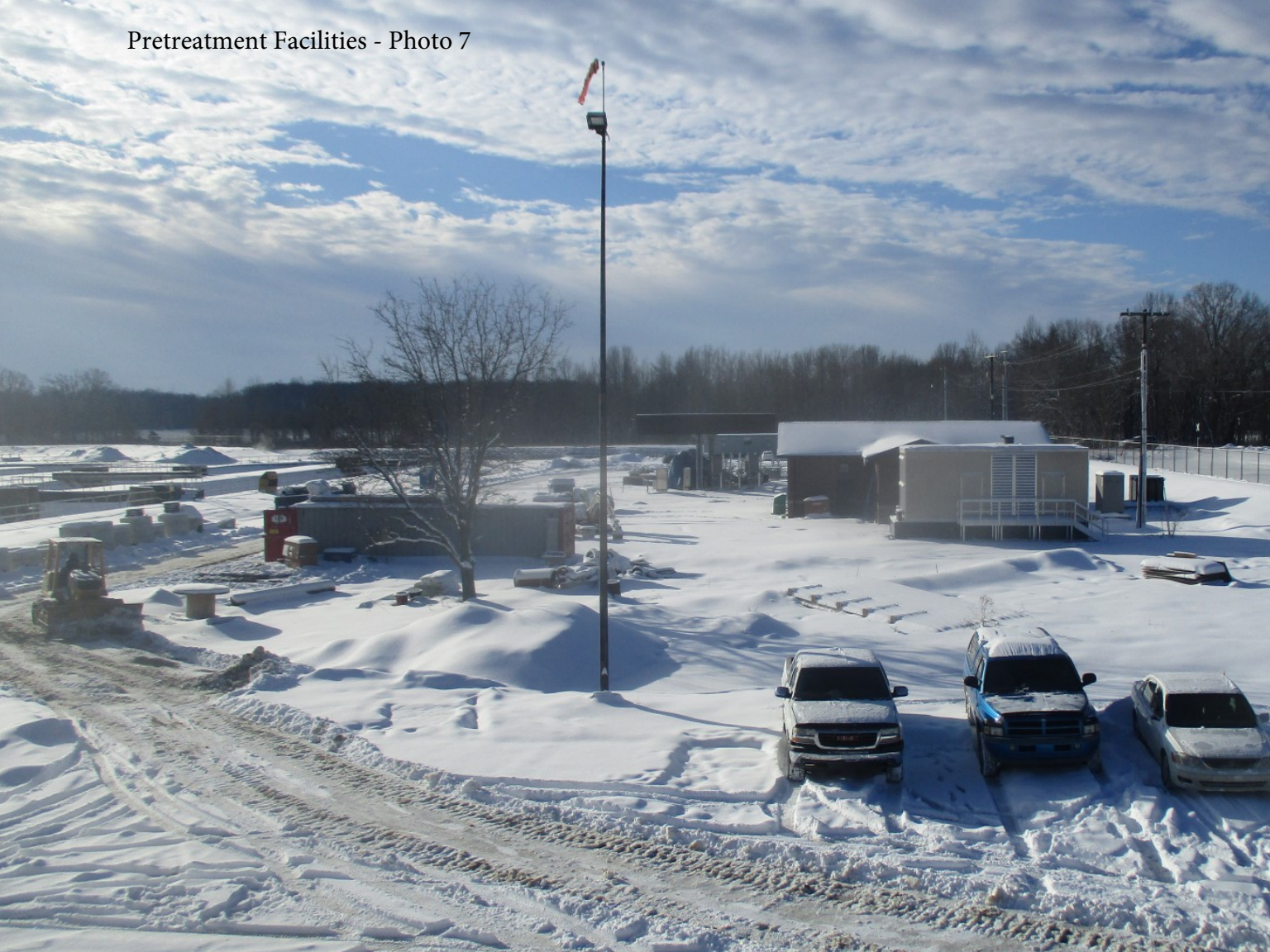
Pretreatment Facilities - Photo 7