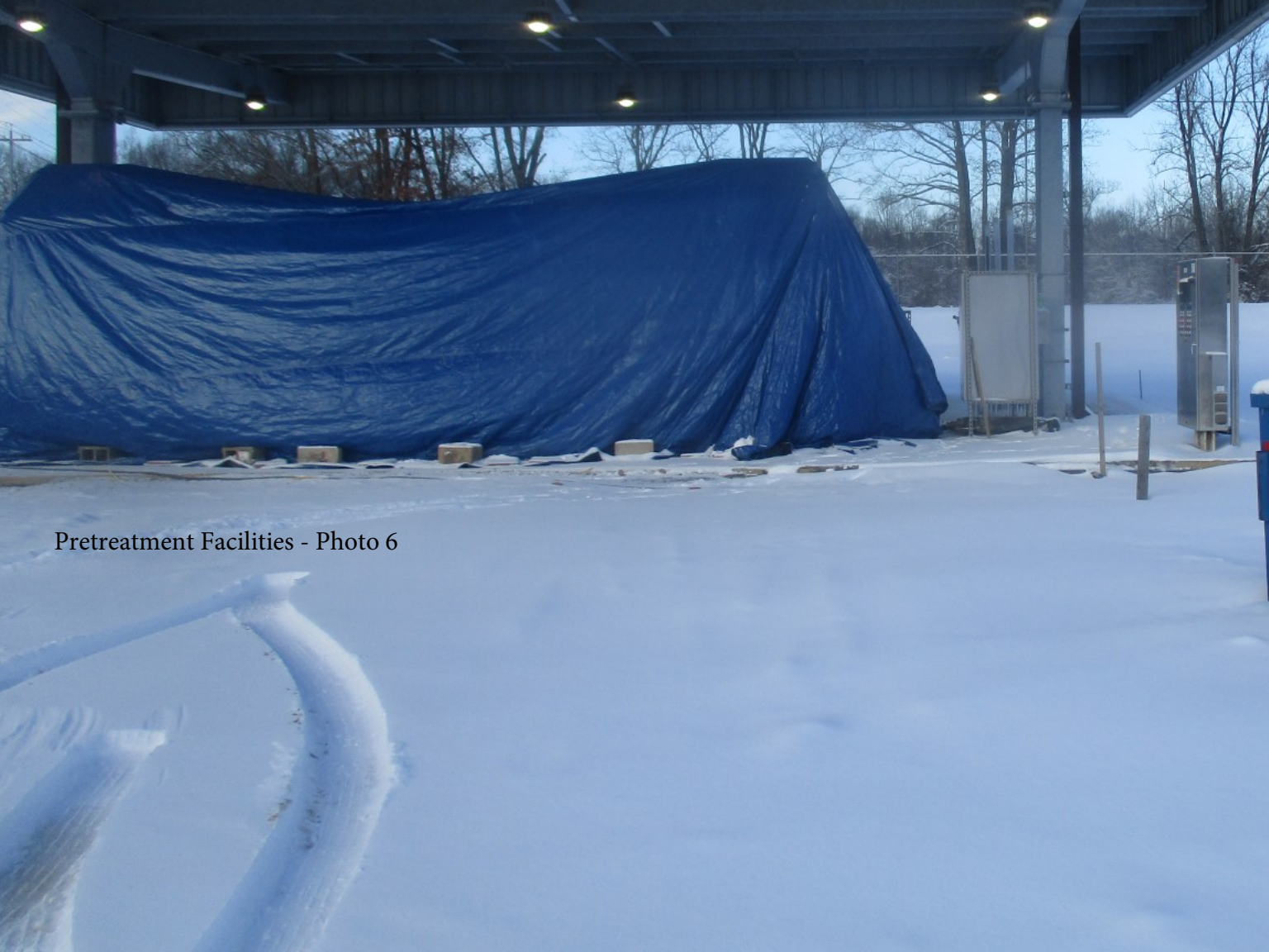
Pretreatment Facilities - Photo 6